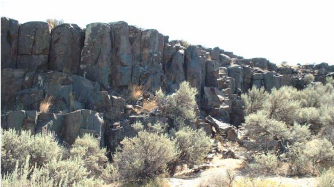
Photo Below: One of many bedrock outcrop which potentially contribute to natural Uranium species in sediment samples.

Plutonium 239 does not have a natural component. It is produced through the neutron bombardment of U-238. It has a half-life of 24,100 years. New Mexico locations reported 239/240Pu concentrations at 0.008 to 0.01 pCi/g (ref. 6)